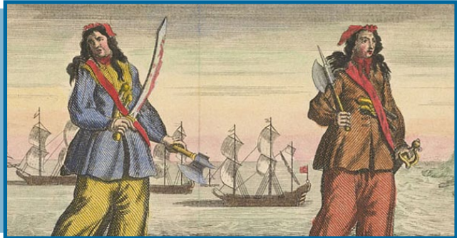
Anne Bonny and Mary Read

Although most pirates were men, some were women. Mary Read and Anne Bonny were the most famous women pirates. They worked together to capture ships until they were caught in 1720.