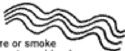
Fire or smoke or water or blood