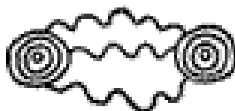
Waterholes connected by running water