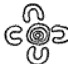
Usually means four women sitting