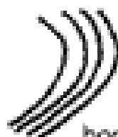
Clouds, boomerangs or windbreaks